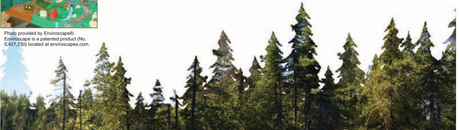
Enviroscope is a patented product (No. 5,427,530) located at enviroscapes.com .

Janet Geer - City of Bothell Contact Janet for environmental community service and stewardship opportunities. (425) 486-2768 or Janet.Geer@ci.bothell.wa.us .